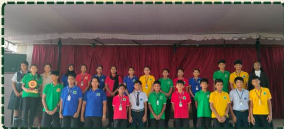
CLASS 7 A