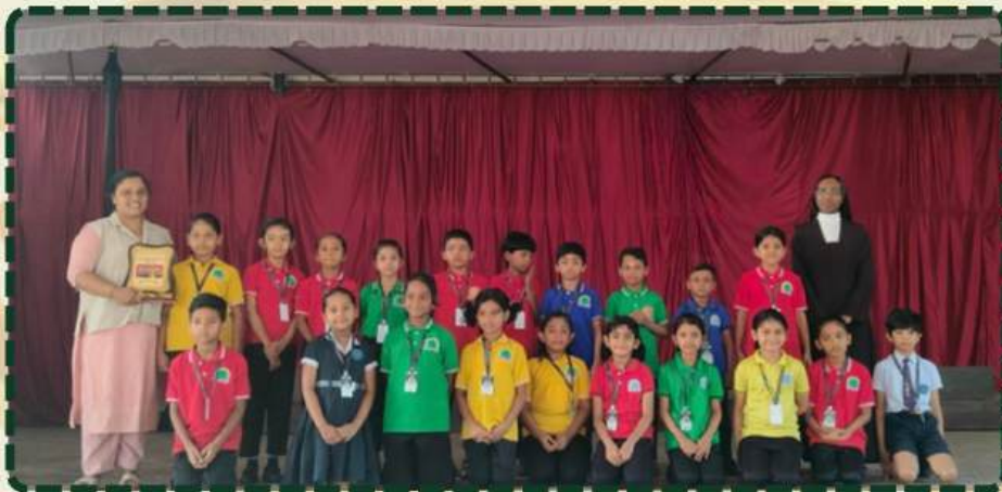
CLASS 2 B