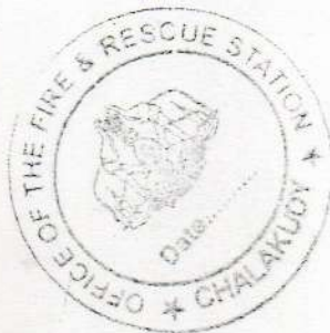
Station Officer Fire & Rescue Station, Chalakudy

3. This Certificate is issued on the condition that the fire fighting system installed will be Kept always functional and the owner of the building should take special care to maintain the systems installed in proper working condition. This certificate is valid for one year from the date of issue. After one year the certificate must be renewed. Non renewal of the certificate within the time limit will result in loss of eligibility for insurance coverage and appropriate legal action by the local self Government/Revenue Department. All Officers of and above the rank of the Station Officers of the Fire & Rescue Services Department will have the right to inspect the building on any day/time after serving 7 days notice to ensure that the installed systems are in good working condition.