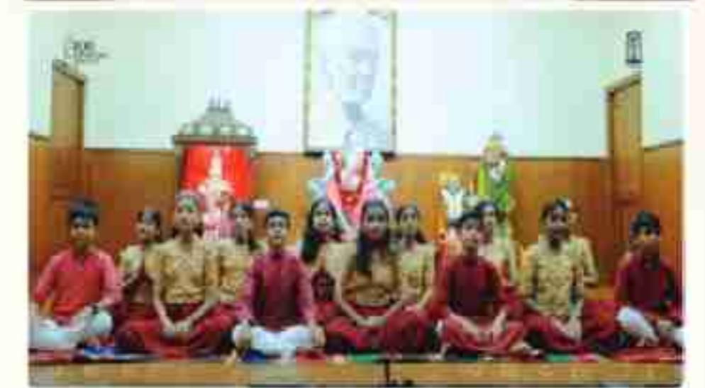
4 of 14 | Bhagavat Gita - Chapter 9 | Swami Chinmayaranda | Chinmaya Misra